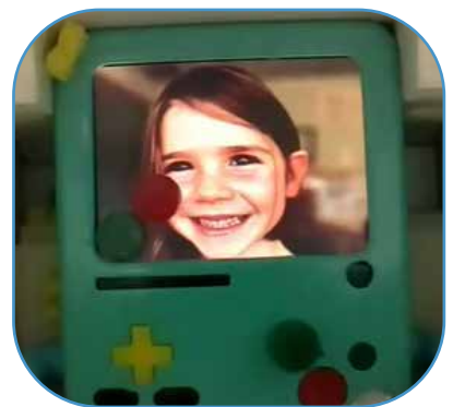
Students create personalized video messages in space with BMO.

Level 0 ISS Quester A Quester is one who seeks. Inspire the Quester in your students by using block coding to create unique Space Art with Ferrofluids and Iron Filings in microgravity and personalized video messages on BMO to send to their friends and family from space.